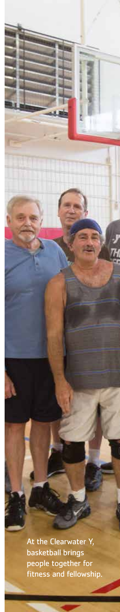
At the Clearwater Y, basketball brings people together for fitness and fellowship.